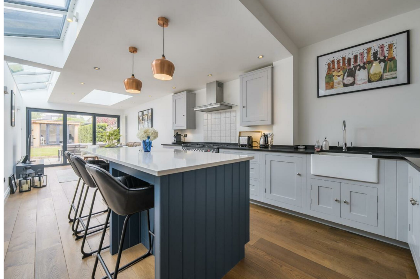
Guide Price £1,100,000